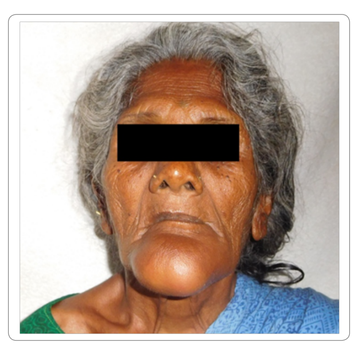
Figure 1: Extraoral view of the patient.

A 70-year-old female presented with a chief complaint of a slow-growing swelling in the anterior part of the lower jaw for the past six months. She had a history of pain in the lower front tooth region, for which she consulted a private practitioner six months back, were the removal of the offending teeth was done. Following this, she noticed a progressive enlarging swelling in the lower chin region, which was asymptomatic. An extraoral examination of the patient revealed diffuse swelling of 6 cm x 6 cm in size present at the chin region and obliteration of the mentolabial sulcus. It had extended superiorly from the lower lip to inferiorly to the lower border of the mandible involving the entire chin region (Figure 1).