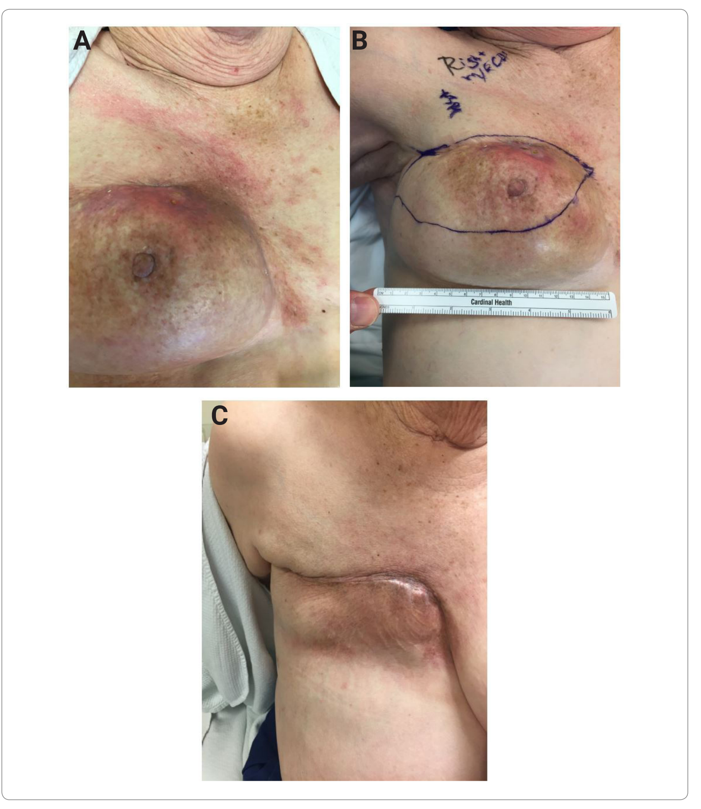
Figure 1: A: Right breast exhibiting severe radiation-induced fibrosis as well as erythema and skin breakdown superiorly; B: Appearance of the right breast at the time of surgery. There was minimal improvement of the skin following 10 months of physical therapy and local wound care; C: Appearance of the right chest wall 6 months following right simple mastectomy.

normal glandular structures (Figure 3C). There was no underlying carcinoma or neoplasia identified. The findings of dense fibrosis with associated calcifications and infiltration of the breast parenchyma were felt to be consistent with the clinical diagnosis of radiation-induced fibrosis.