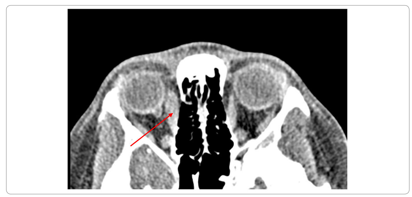
Figure 2: Orbital CT, axial. Prominent medial rectus enlargement is appreciated (red arrow), to include involvement of the myotendinous junction.