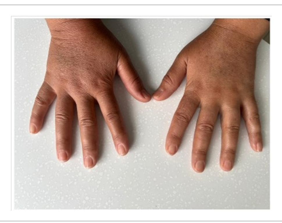
Figure 1: Puffy hands without sign of cutaneous sclerosis.

an overlap syndrome of BD and systemic sclerosis. The follow-up visit six months later was uneventful, with disease remission and symptom control. A summary of laboratory findings throughout the evaluation period is given in (Table).